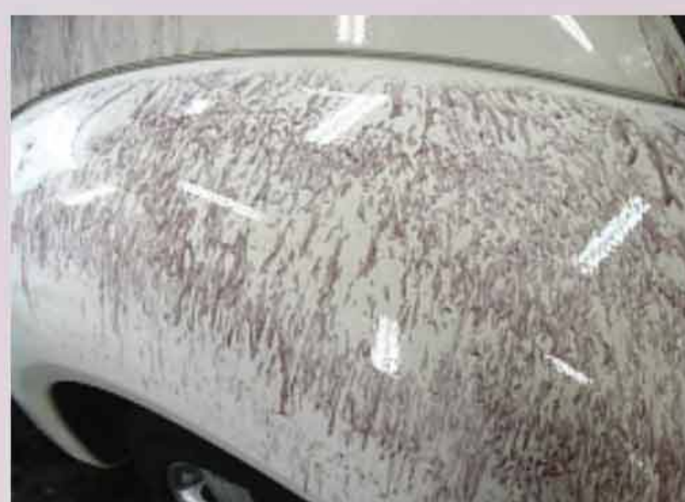
Reaction on car paint