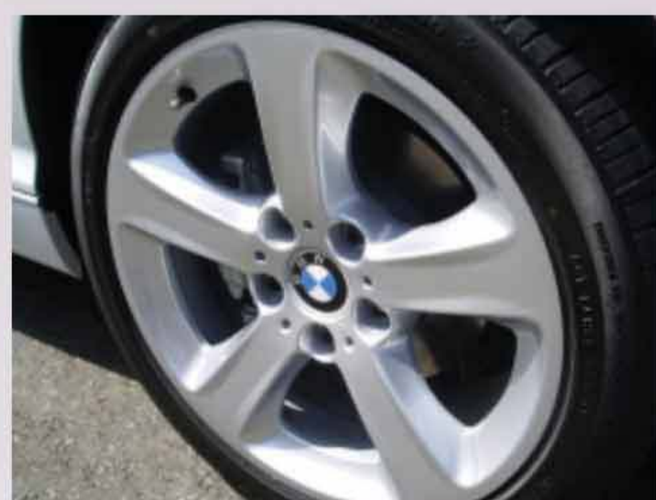
Result after wash